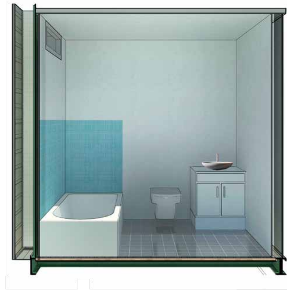
Bathroom side view