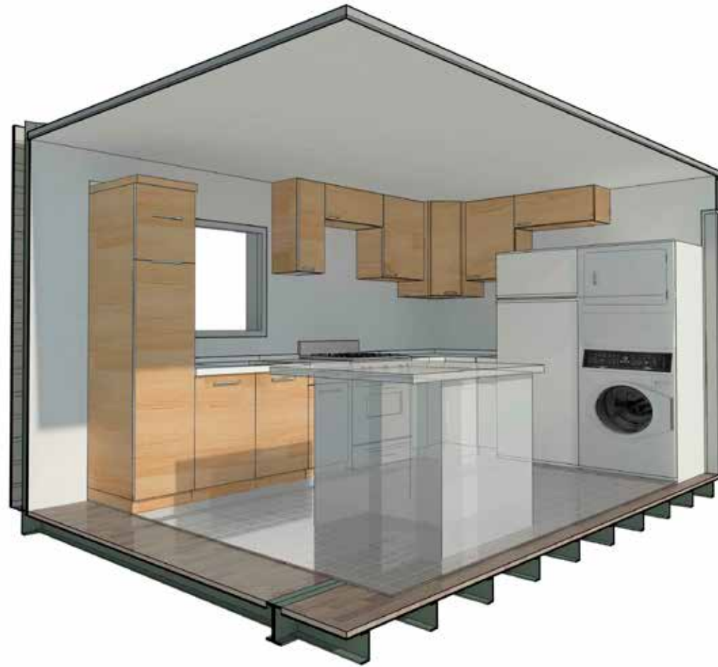
Kitchen side view