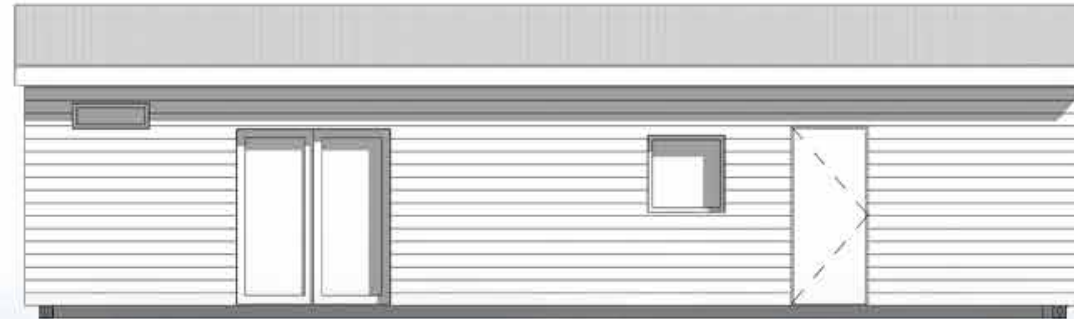
VISTA 3 $65- $162 per square foot 706.68 s.f.; three- bedroom, two-bath