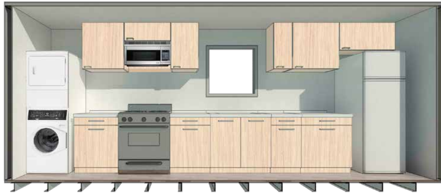
Kitchen side view