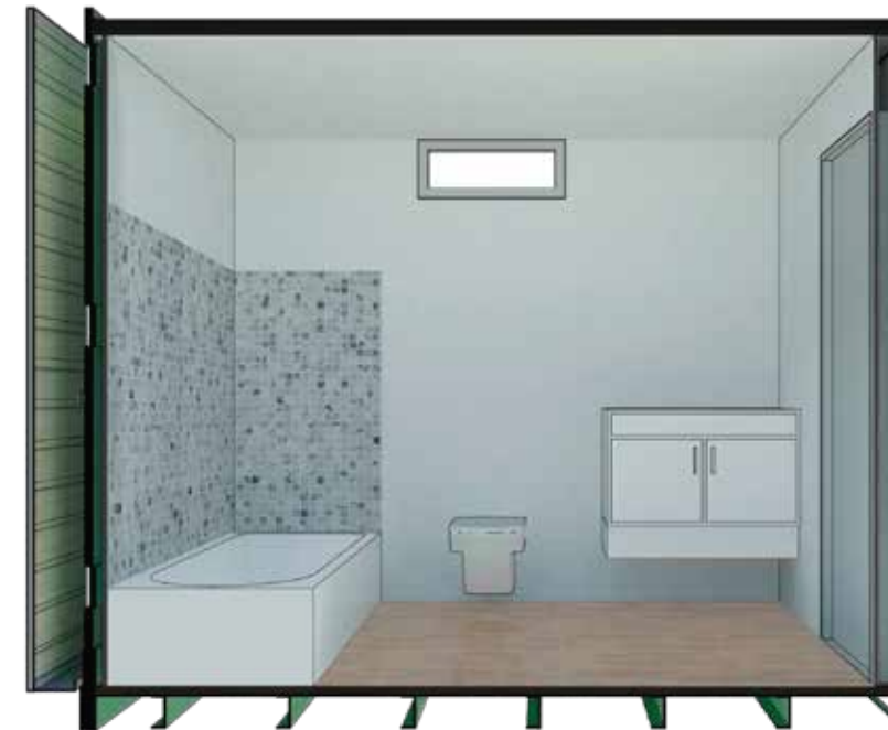
Bathroom side view