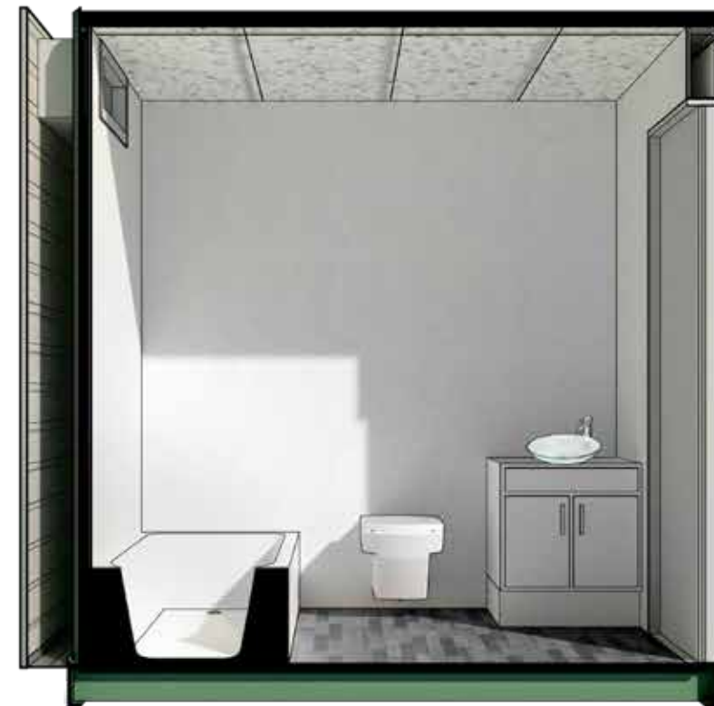
Bathroom side view