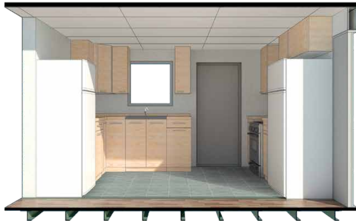
Kitchen side view